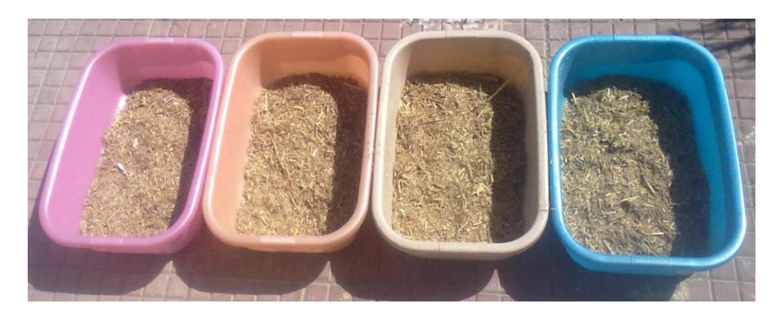
Fig.1 Control and treated rice straw fibre